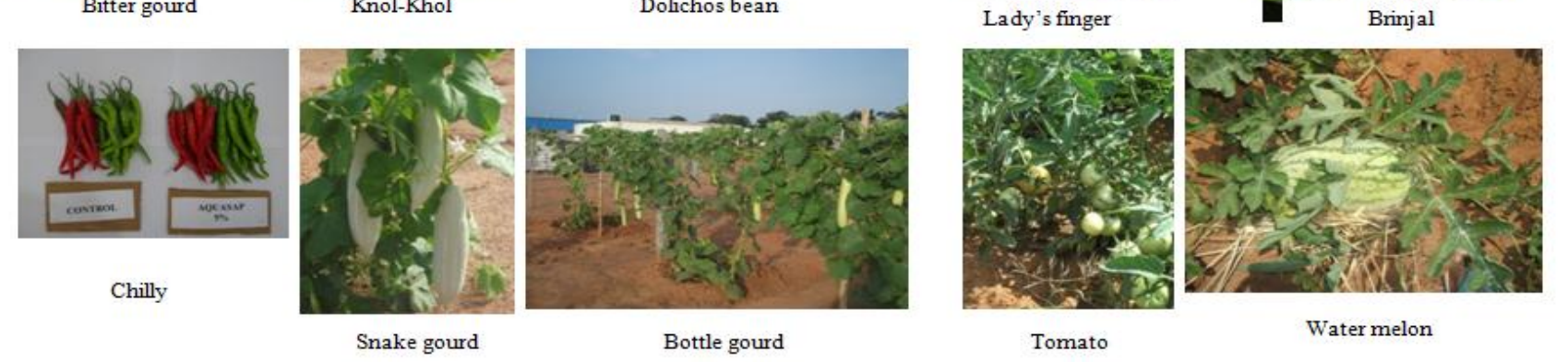
Figure 1 Some of the vegetable crops studied in the present investigation with their vegetable yield