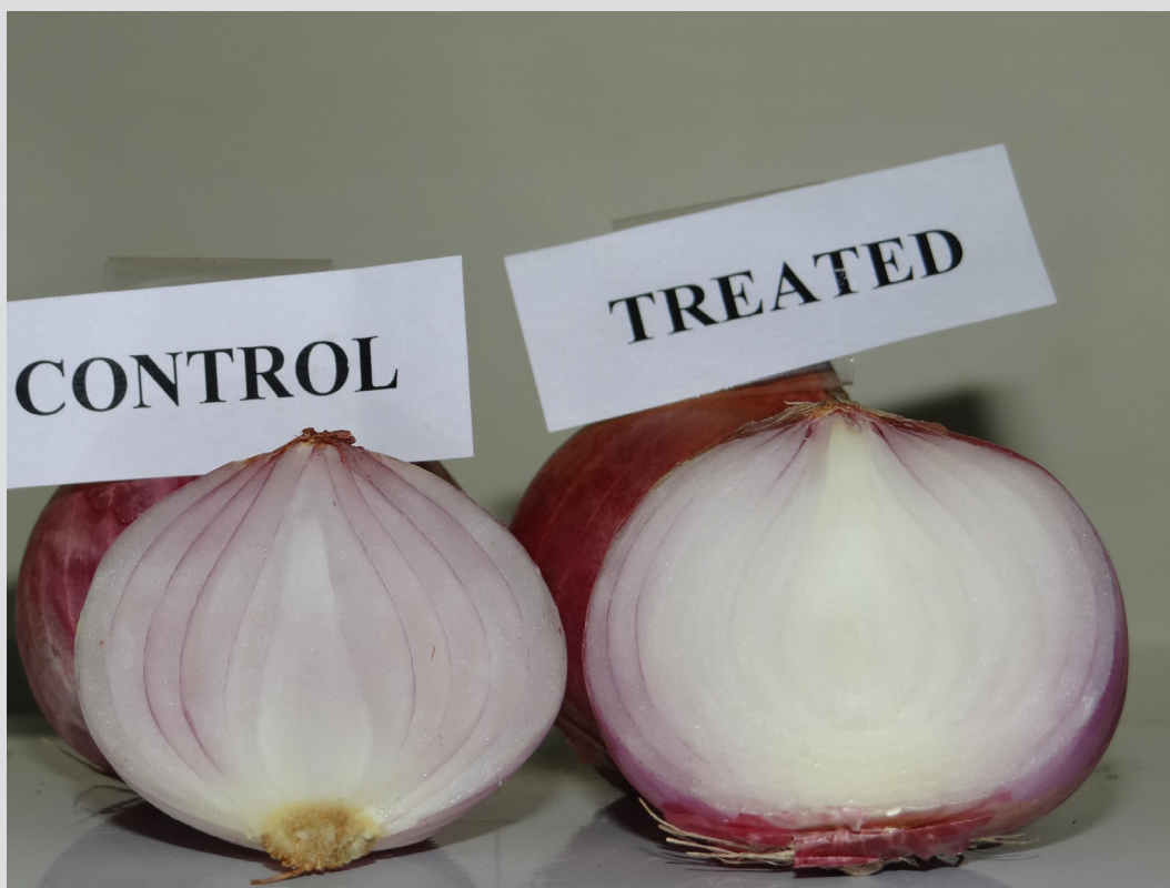
Fig 2: Texture of onion bulb of control and treated plants

PW- Plant weight (g), PL- Plant length (cm), NOR- No. of root (nos.), RL- Root length (cm), NOL- No. of leaves (nos.), LL- Leaves length (cm), LW- Leaves weight (g), BW- Bulb weight (g), DB- Diameter of bulb (mm), DN - Diameter of neck (mm).